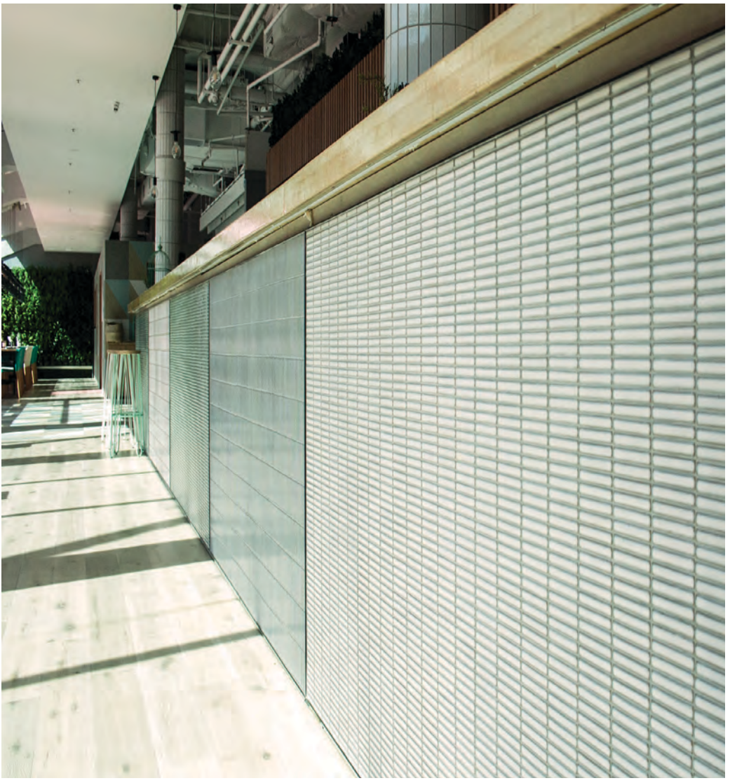
Variation is an inherent property of tiles and stone. Sizes are nominal and may include a joint.