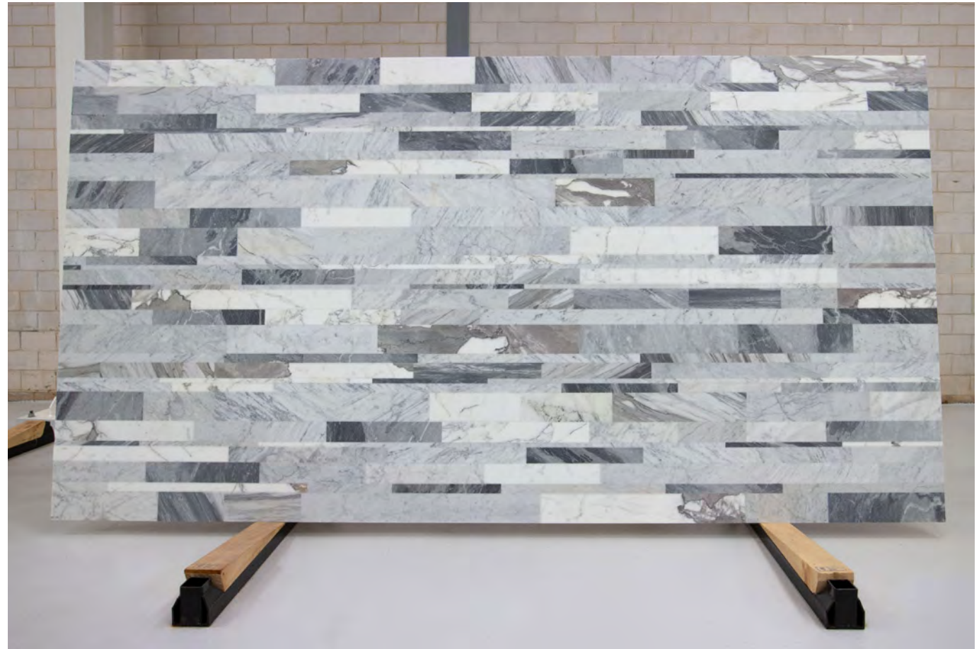
CARRARA MIX HONED