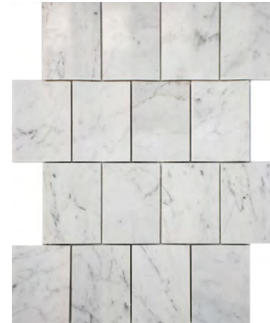
CARRARA C HONED