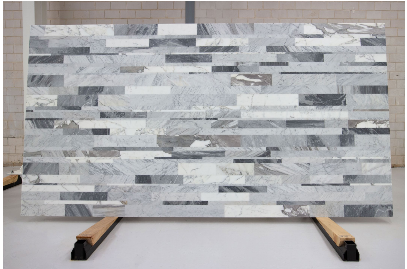
CARRARA MIX HONED