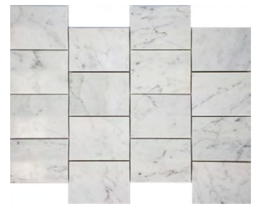
Carrara C Honed