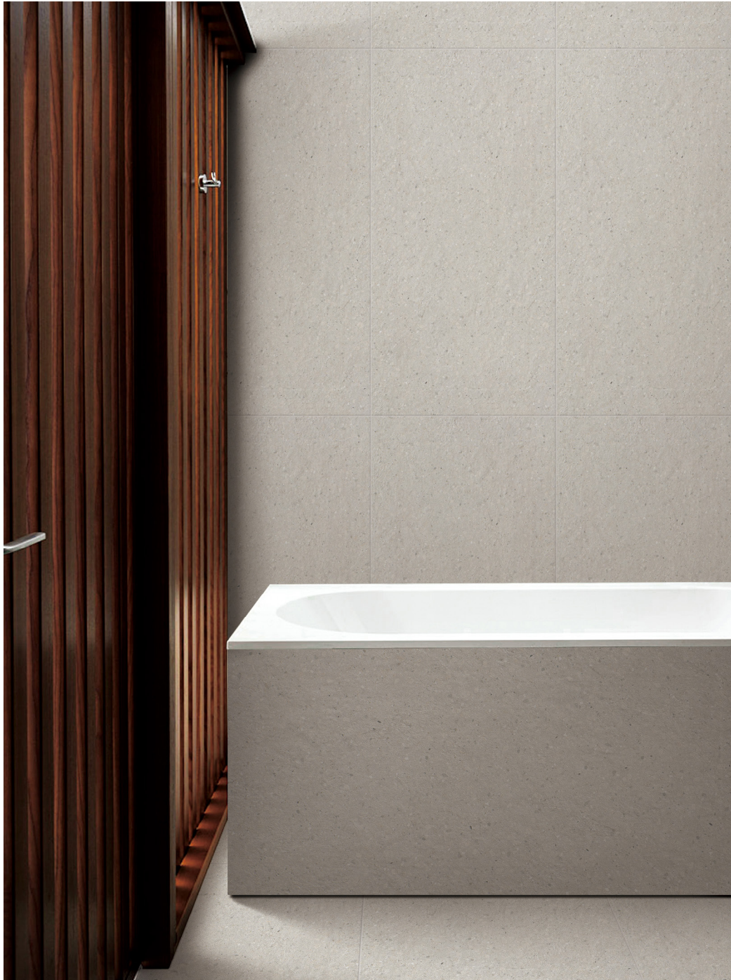
left pictured: pearl right pictured: cotto