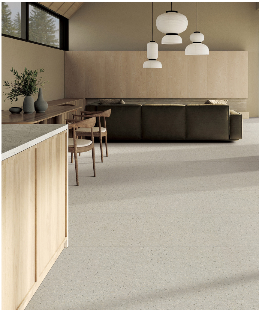
left pictured: argent right pictured: bluestone