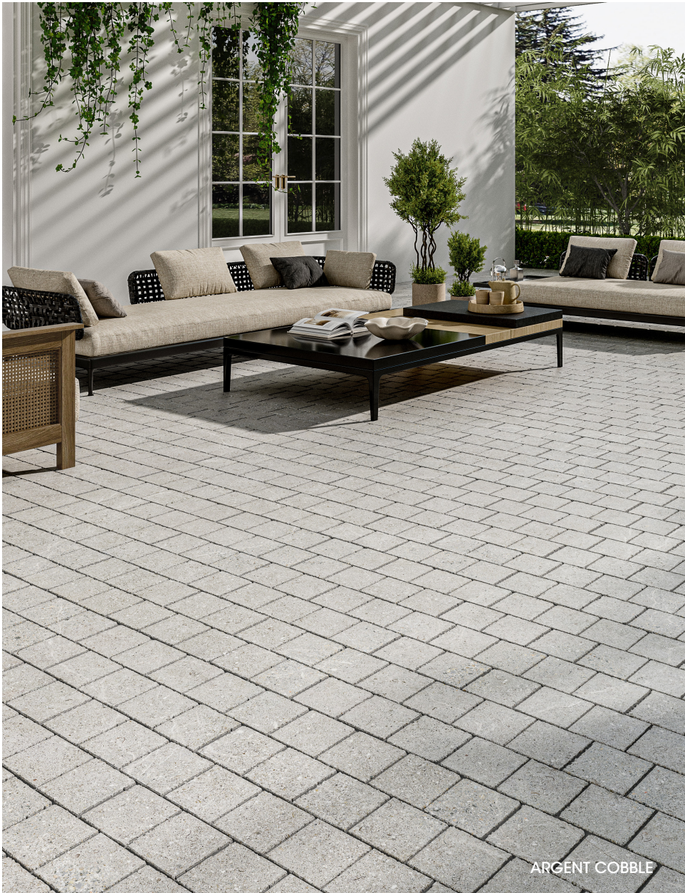
Variation is an inherent property of tiles and stone. Sizes are nominal and may include a joint.

ISO 14001:2015 specifies the requirements for an environmental management system that an organization can use to enhance its environmental performance. ISO 14001:2015 is intended for use by an organization seeking to manage its environmental responsibilities in a systematic manner that contributes to the environmental pillar of sustainability.