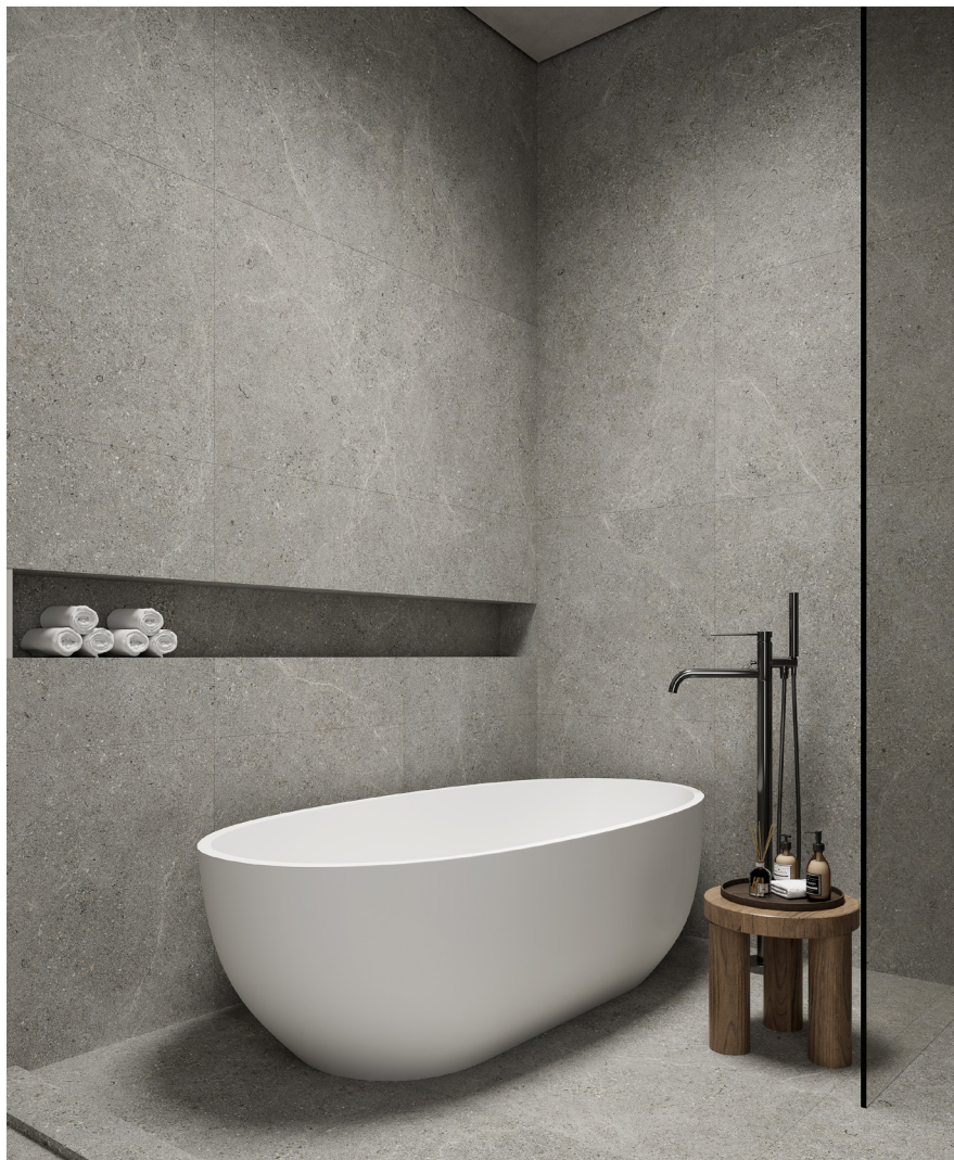
BELEN TAUPE 600x600mm