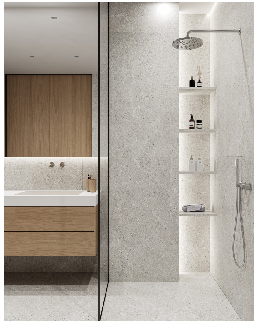
BELEN ARGENT 600x1200mm